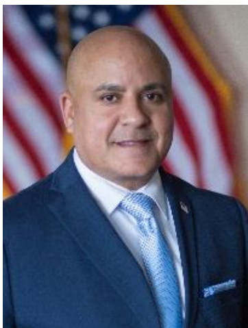
Mayor Frank Moran